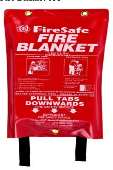
Fire Blanket $55