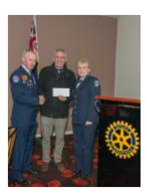
CFA Edithvale: Lowe Constructions