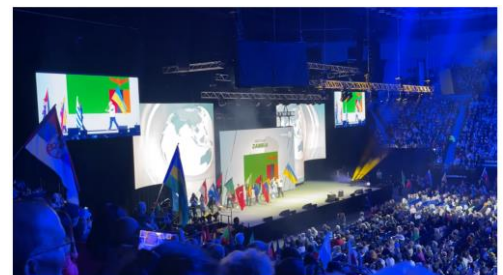
Flag Ceremony Rotary International Convention, Melbourne Australia