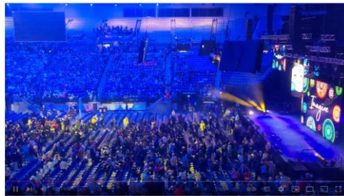
Opening Ceremony at the 2023 Rotary International Convention in Melbourne