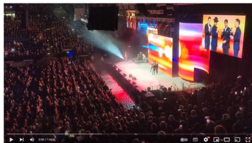
Bohemian Rhapsody at the 2023 Rotary International Convention in Melbourne by the Tenors