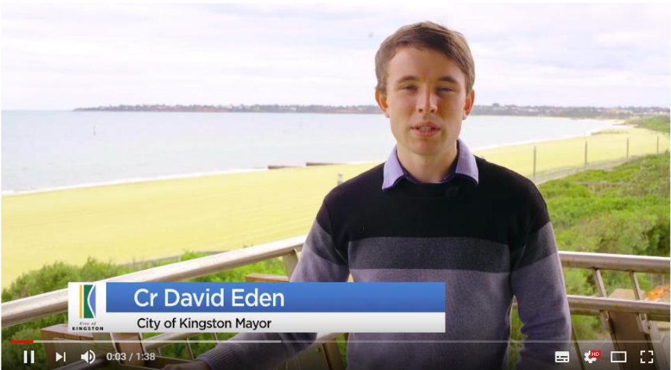
February 2017 Kingston Council Mayor’s Blog