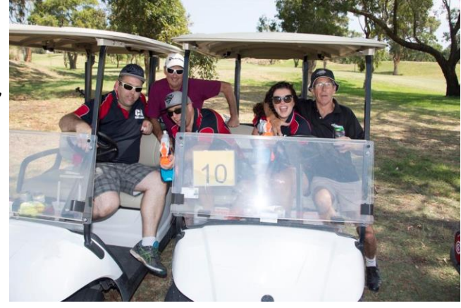
There were many different styles displayed - the traditional and focussed style and...

...those who were more like Groucho Marx / WC Fields