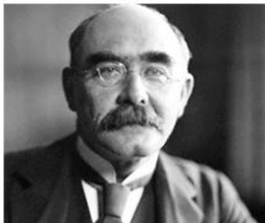
Rudyard Kipling (1865-1936)

If you can talk with crowds and keep your virtue, Or walk with Kings- -nor lose the common touch, If neither foes nor loving friends can hurt you, If all men count with you, but none too much: If you can fill the unforgiving minute With sixty seconds' worth of distance run, Yours is the Earth and everything that's in it, And- -which is more- -you'll be a Man, my son!