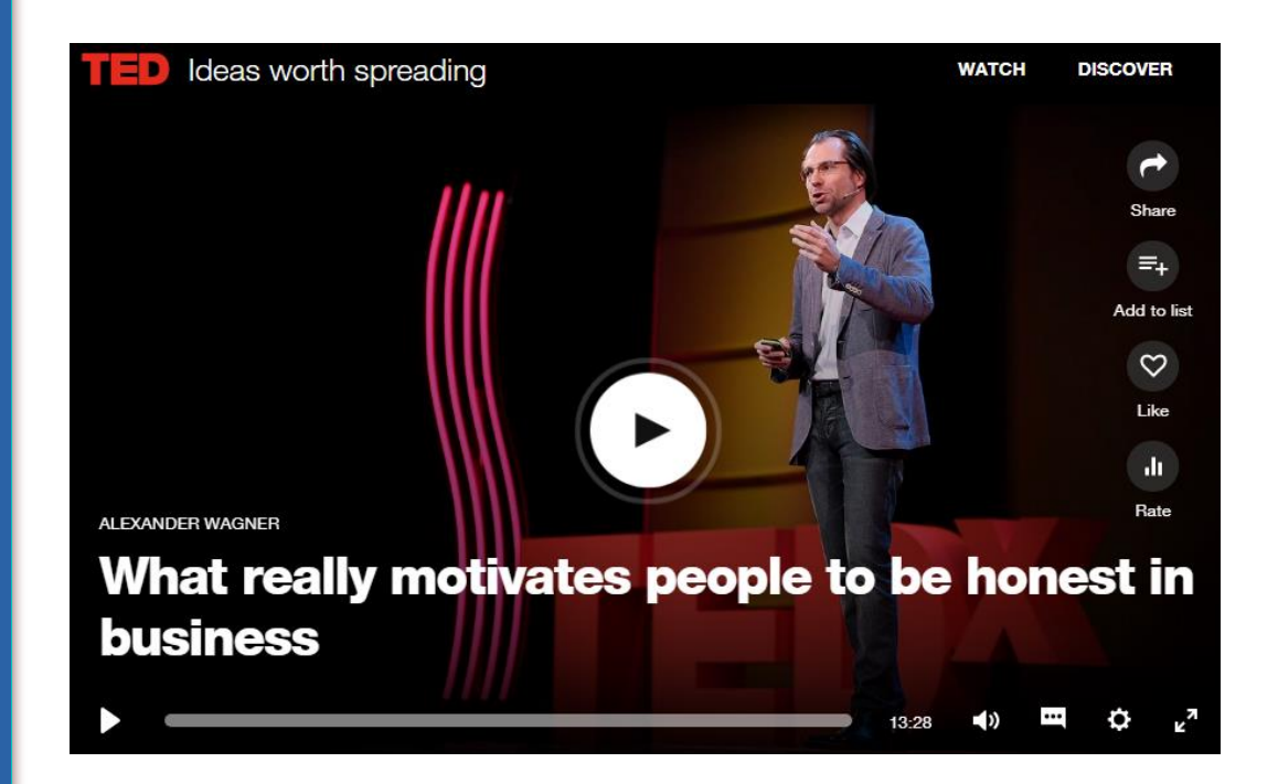
Click the picture to watch the talk