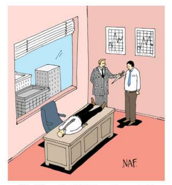
"What's the problem? We told you when you started you'd have to make some sacrifices."