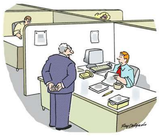
"This promotion means you'll be getting the blame directly from me."