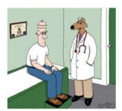
"I'm afraid I can't treat you, Mr. Fisk. I have a conflict of interest."