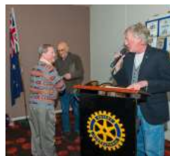
Historical Society: Bendigo Bank