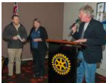
Volunteer Coast Guard: Patterson River Golf Club