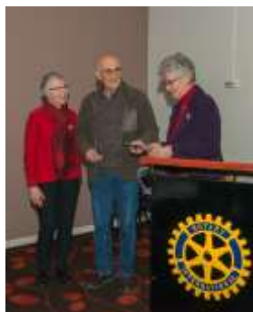
Winter Warmers: Bendigo Bank