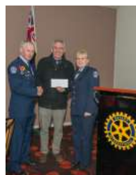
CFA Edithvale: Low Construction