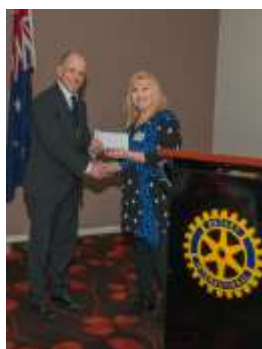
Patterson River Secondary College: Resilient Workplaces