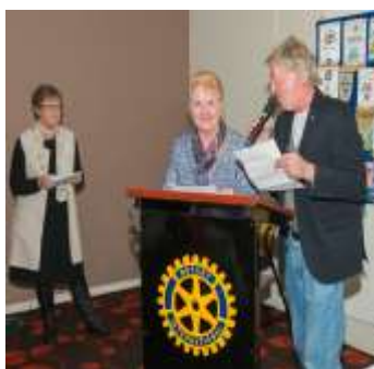
Longbeach Place: Rotary