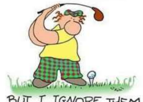
BUT I IGNORE THEM