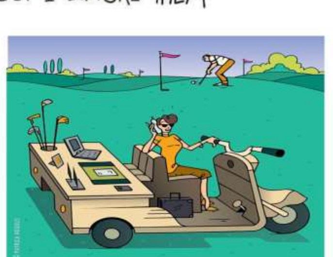
"I'M SORRY, MR JONES HAS JUST STEPPED AWAY FROM HIS DESK."