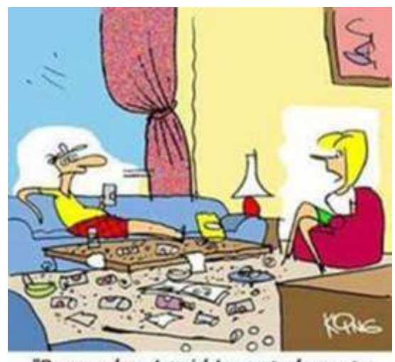
"Remember I said I wanted you to stop golfing so you could spend more time at home? Well if you don't mind, I'd like you to go back to golfing."