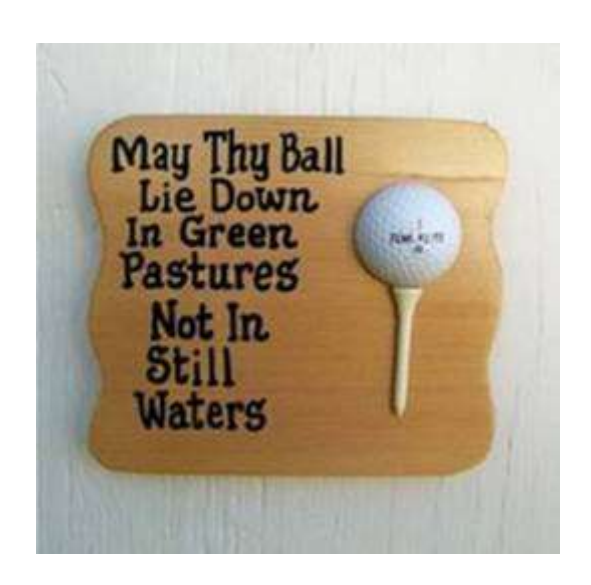
THERE ARE MORE THINGS TO LIFE THAN